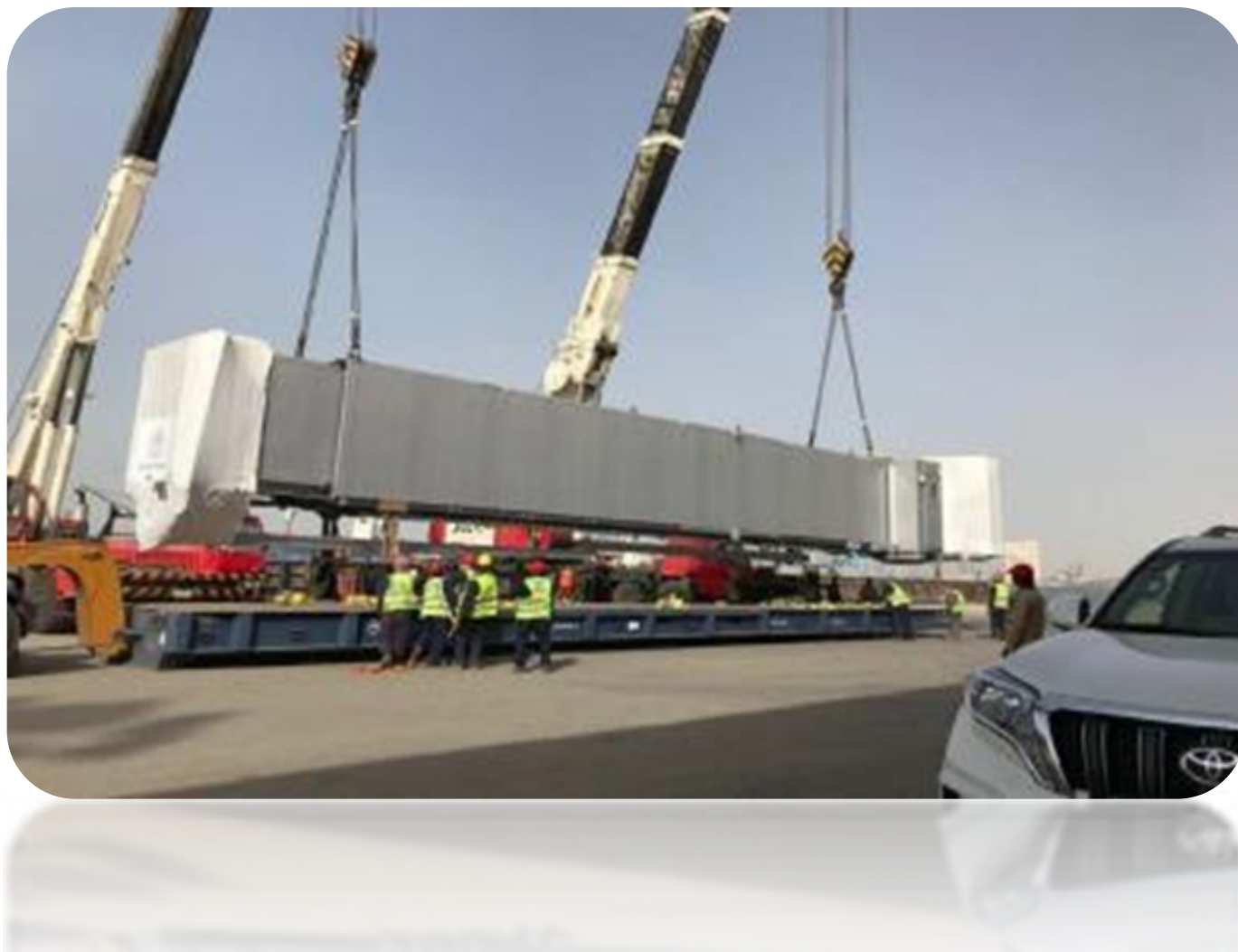
PASSENGER BOARDING BRIDGES AND COMPONENTS FOR CONTRACTOR-THYSSEN KRUPP, SPAIN