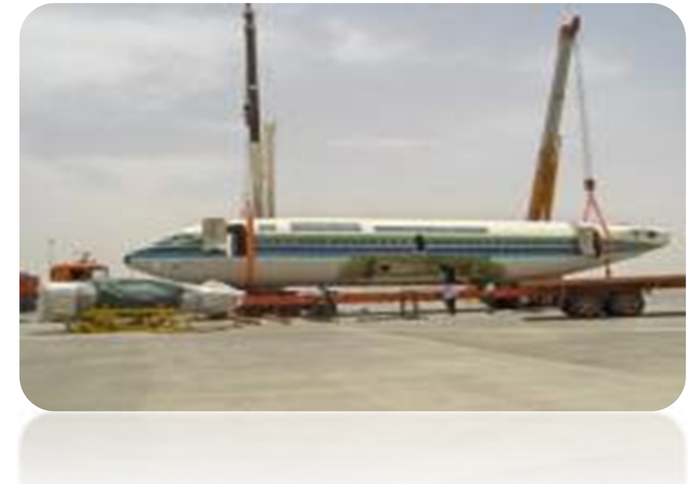
Aircraft Transportation for Australian University, Kuwait