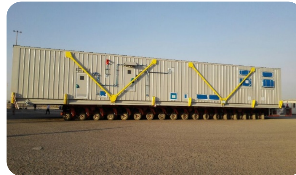
FIELD AUXILIARY ROOM (FAR) Dim: 30.15 * 11.47 * 5.0M (LWH)GWT: 196.10 tons