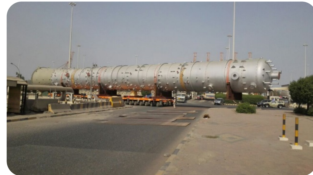
COKER FRACTIONATOR Dim: 65.30 * 7.30 * 7.90M (LWH) GWT: 327 tons