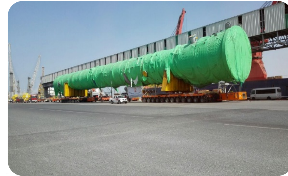
DEISOPENTANIZER Dim:83.8 * 8.62 * 9.87M (LWH) GWT: 480 tons