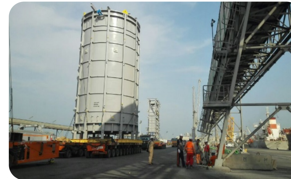
RADIANT MODULE RM-01 Dim: 10.00 * 8.90 * 17.00M (LWH) GWT: 196.00 tons