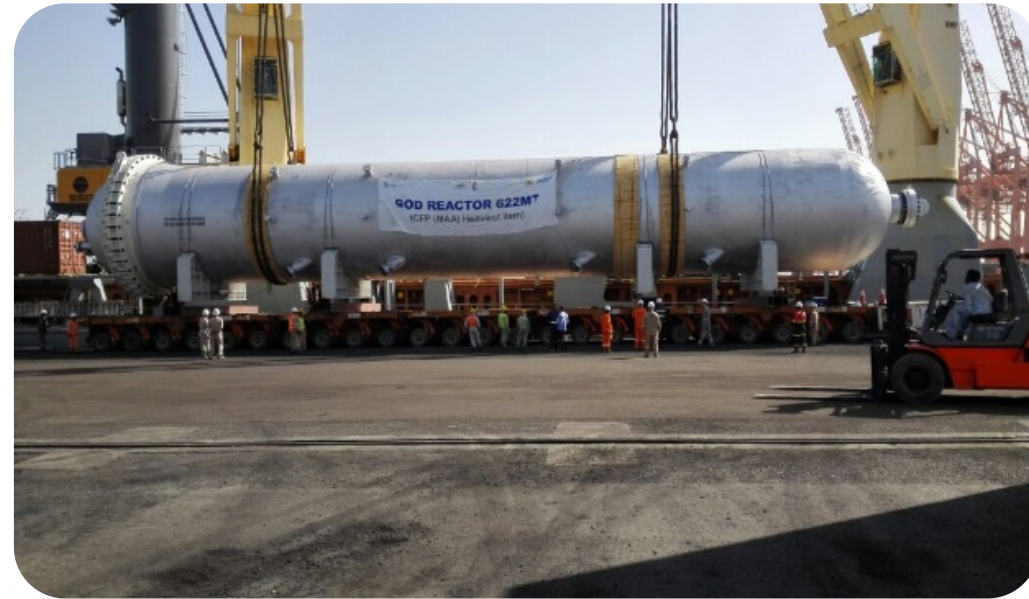
GOD REACTOR Dim:38.47 * 6.46 * 6.58(LWH) GWT: 622 tons