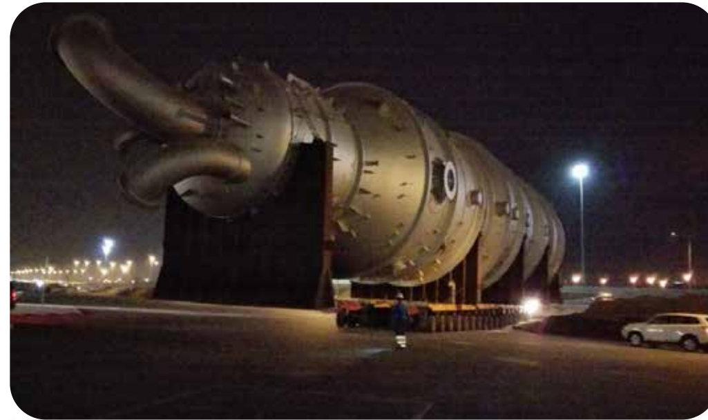
VACUUM COLUMN Dim:60.10 * 10.80 * 10.95M (LWH) GWT: 535 tons