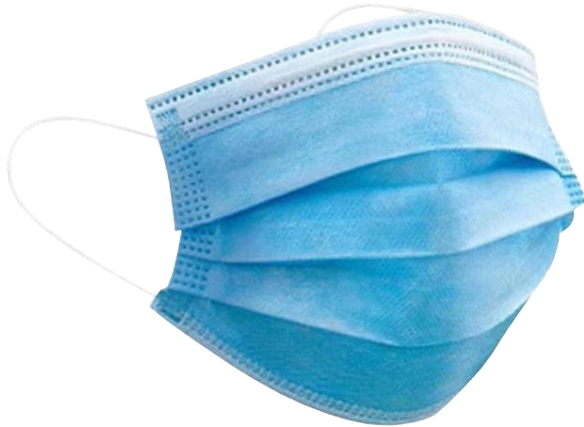
FFP Face Mask