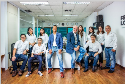
Team Freightzen Logistics Bangkok, Thailand.

Licensed Customs Broker and Counter Service